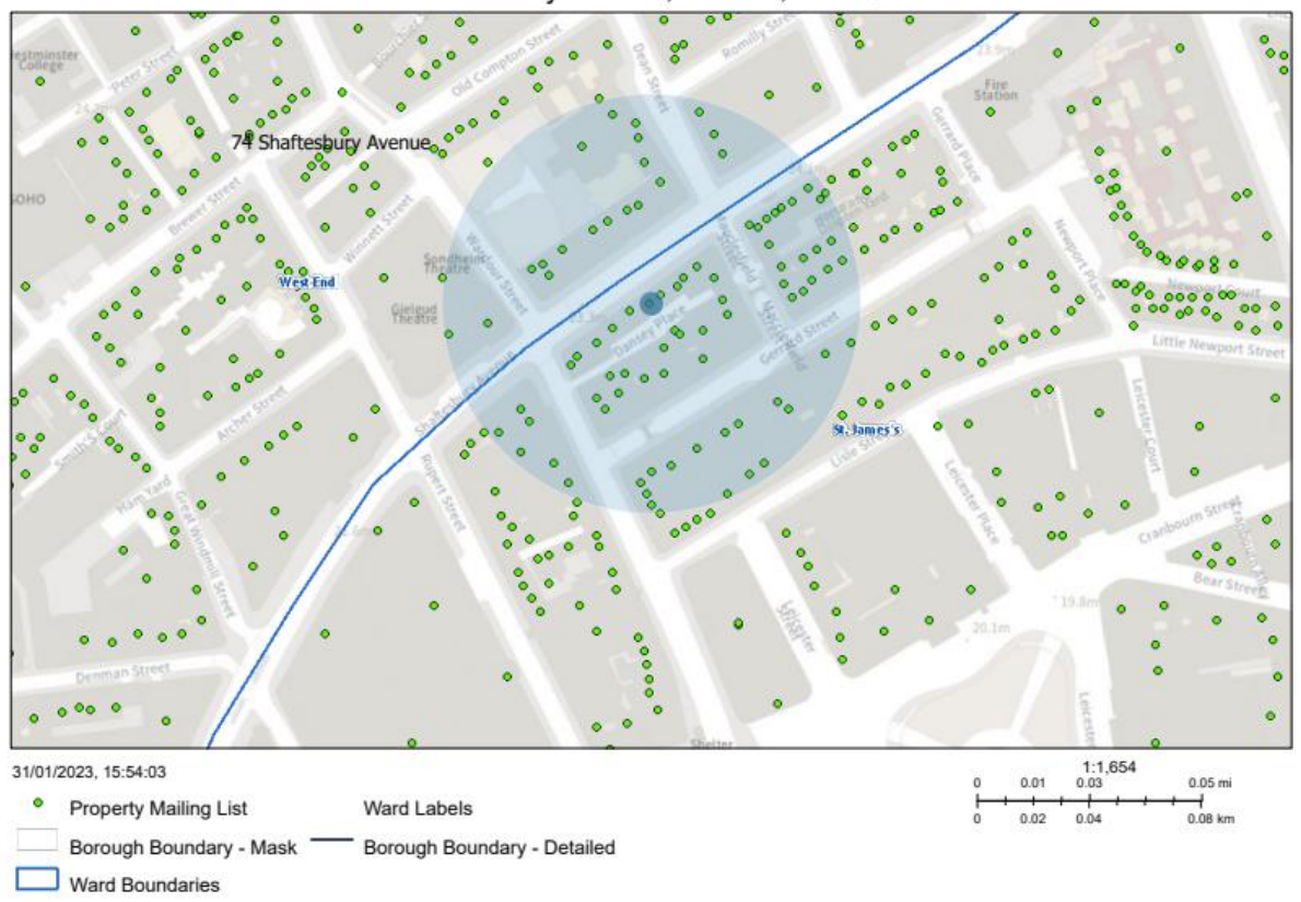
74 Shaftesbury Avenue, London, W1D 6NB